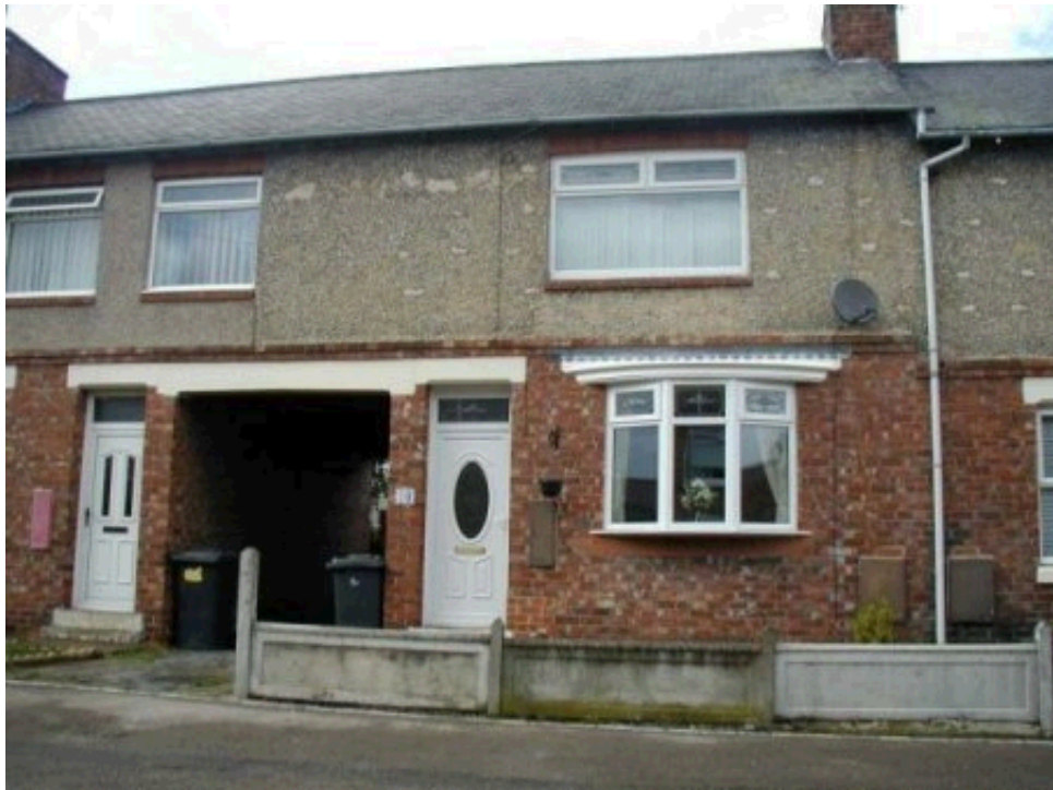
The house, 10 Fife Street, Chester-le-Street, where the Gillilands lived from around 1915 to 1921.