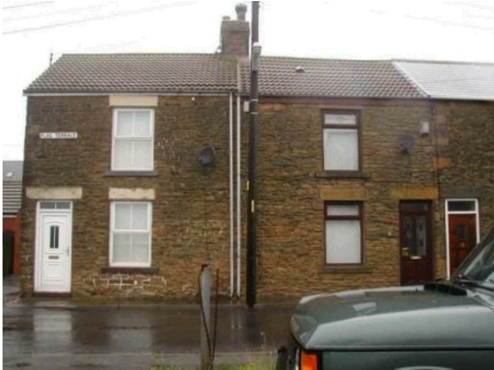
The house with the black door, 2 Flag Row, Sunnyside, where Ada was born in 1910 and lived until around 1915.